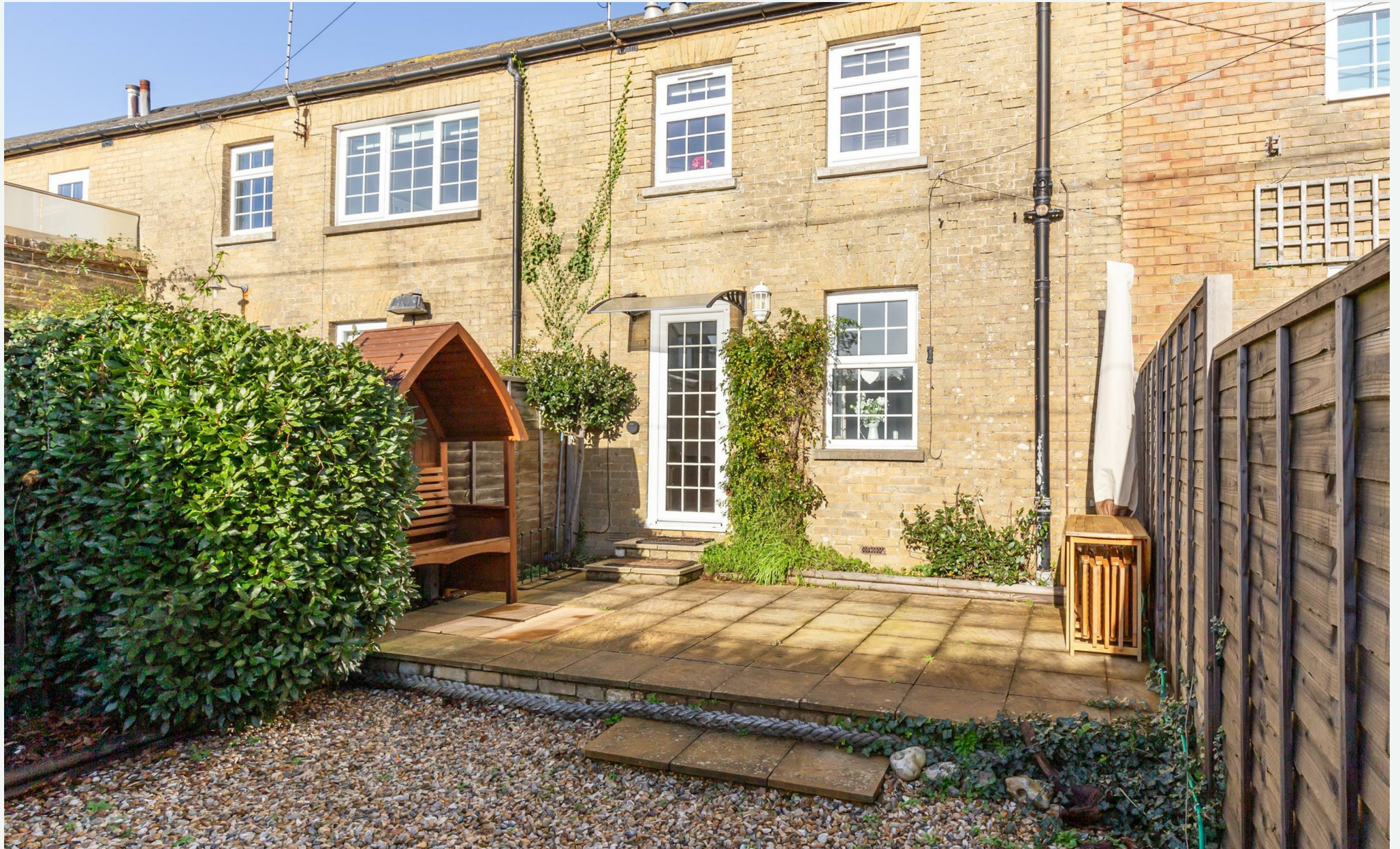
Coxswain Cottage, 24 Forelands Field Road, Bembridge, Isle of Wight, PO35 5TR